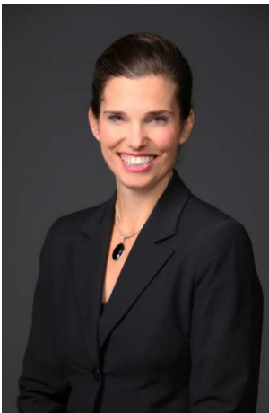
The Honourable Kirsty Duncan Minister of Science

It is my pleasure to present the Departmental Plan for the Social Sciences and Humanities Research Council for 2017–18.